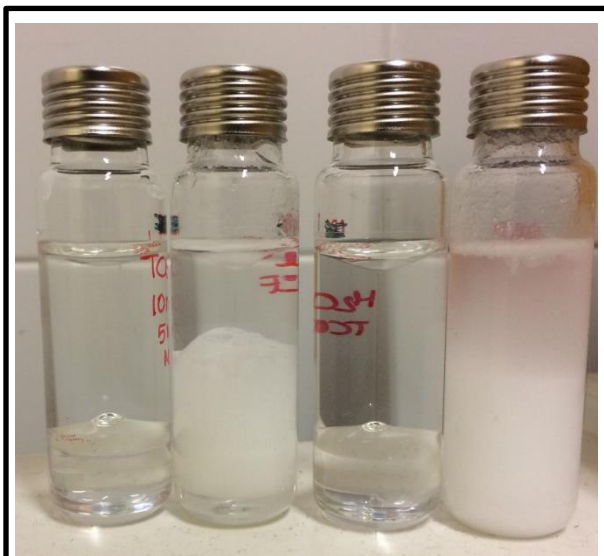
20 ml vials with chlorinated hydrocarbons solutions and LDHs