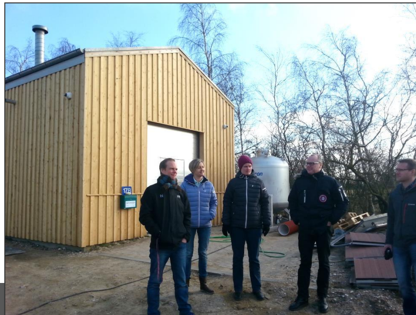
Stengården Landfill, Region Zealand